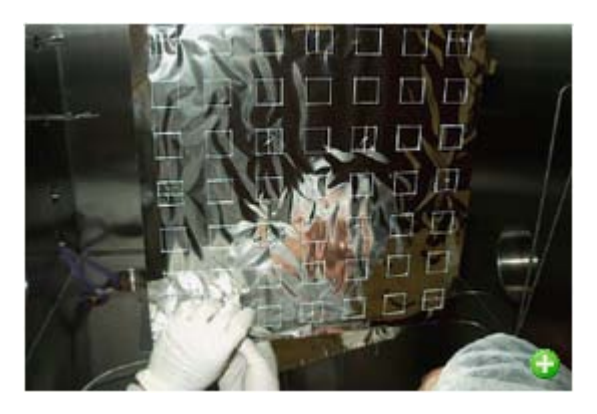
Figure 1. In this Prototype Assembly, a discrete matrix comprising a square array of square frames is placed on a metallized polymer film. In constructing a multilayer insulation blanket, arrays like this one would be placed between all the metallized polymer film layers.

Integrated multilayer insulation (IMLI) is being developed as an improved alternative to conventional multilayer insulation (MLI), which is more than 50 years old. A typical conventional MLI blanket comprises between 10 and 120 metallized polymer films separated by polyester nets. MLI is the best thermal-insulation material for use in a vacuum, and is the insulation material of choice for spacecraft and cryogenic systems. However, conventional MLI has several disadvantages: It is difficult or impossible to maintain the desired value of gap distance between the film layers (and consequently, it is difficult or impossible to ensure consistent performance), and fabrication and installation are labor-intensive and difficult. The development of IMLI is intended to overcome these disadvantages to some extent and to offer some additional advantages over conventional MLI.